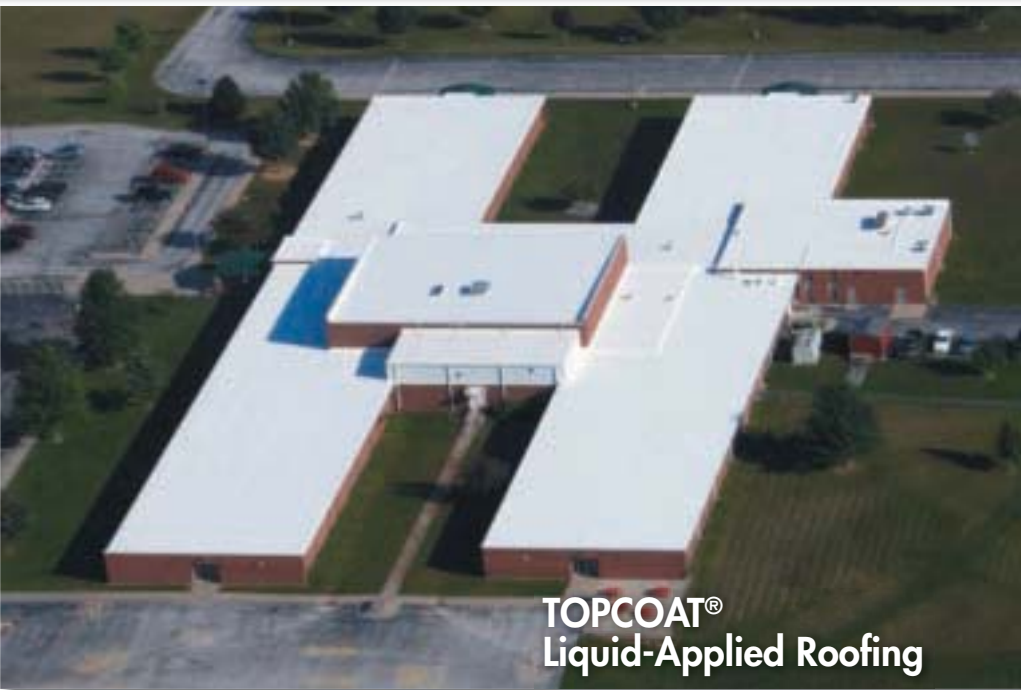
TOPCOAT® Liquid-Applied Roofing