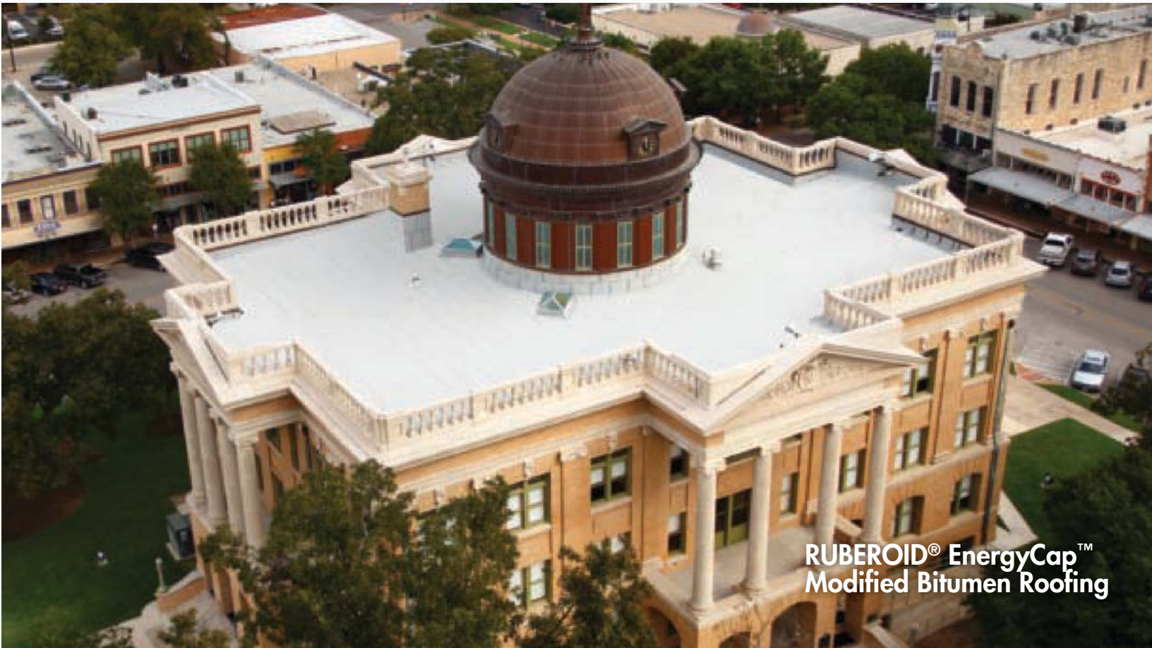
RUBEROID® EnergyCap™ Modified Bitumen Roofing