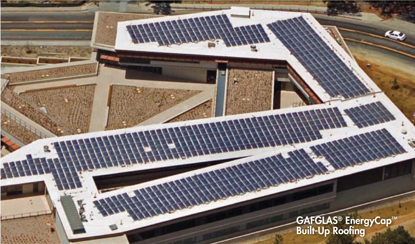
GAFGLAS® EnergyCap™ Built-Up Roofing