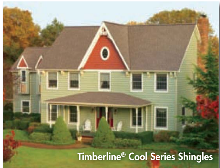
Timberline® Cool Series Shingles

“I wanted the performance and security of a mod bit roof, but with the energy savings of cool. GAF EnergyCap™ was the perfect answer.”