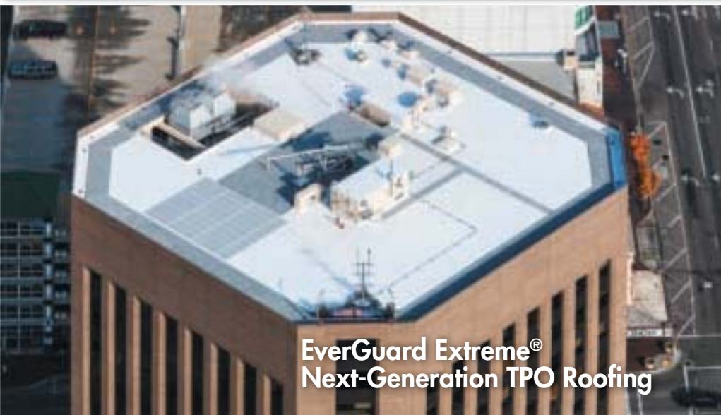
EverGuard Extreme® Next-Generation TPO Roofing