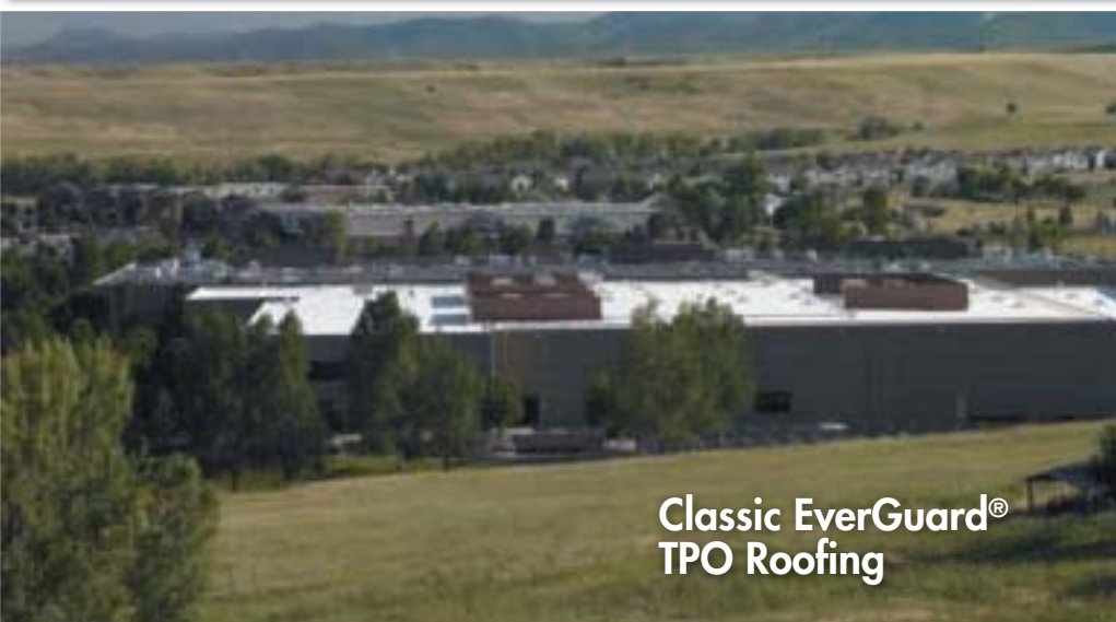
Classic EverGuard® TPO Roofing